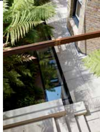
Left: Fisher created a garden on the top storey of his London home with a roll-back roof